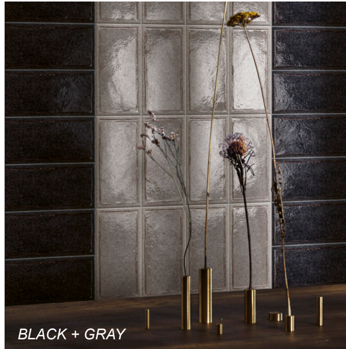
BLACK + GRAY