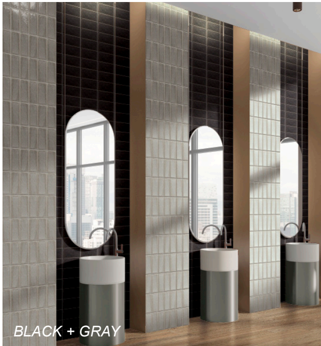
BLACK + GRAY