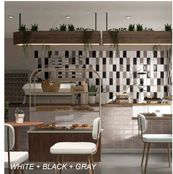
WHITE + BLACK + GRAY