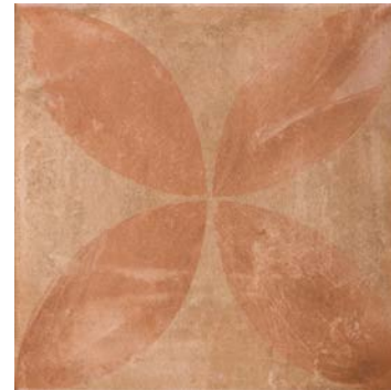
Naturale Fiori Medio