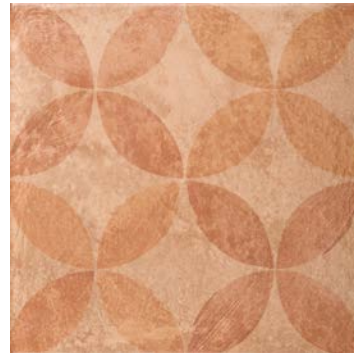
Naturale Fiori Piccolo