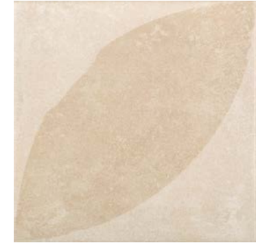
Bianco Fiori Grande