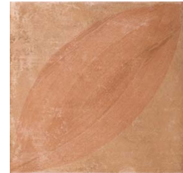
Naturale Fiori Grande