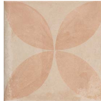
Sabbia Fiori Medio