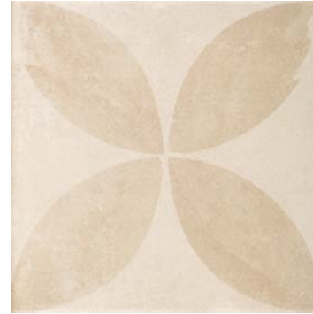
Bianco Fiori Medio