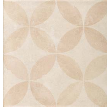
Bianco Fiori Piccolo