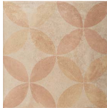
Sabbia Fiori Piccolo