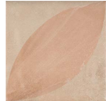
Sabbia Fiori Grande