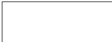
18x48 Relief- Wall Only 13.3mm Thickness